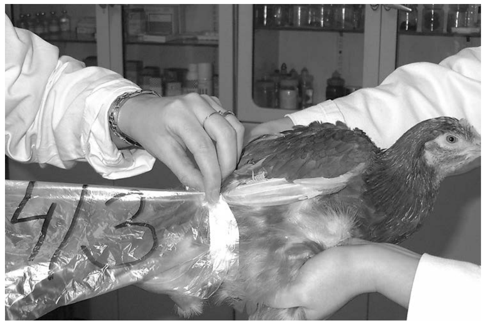
Figure 3. The placing of the collection bag on the adhesive side of tape sealed along the whole perimeter of caudal part of chicken body