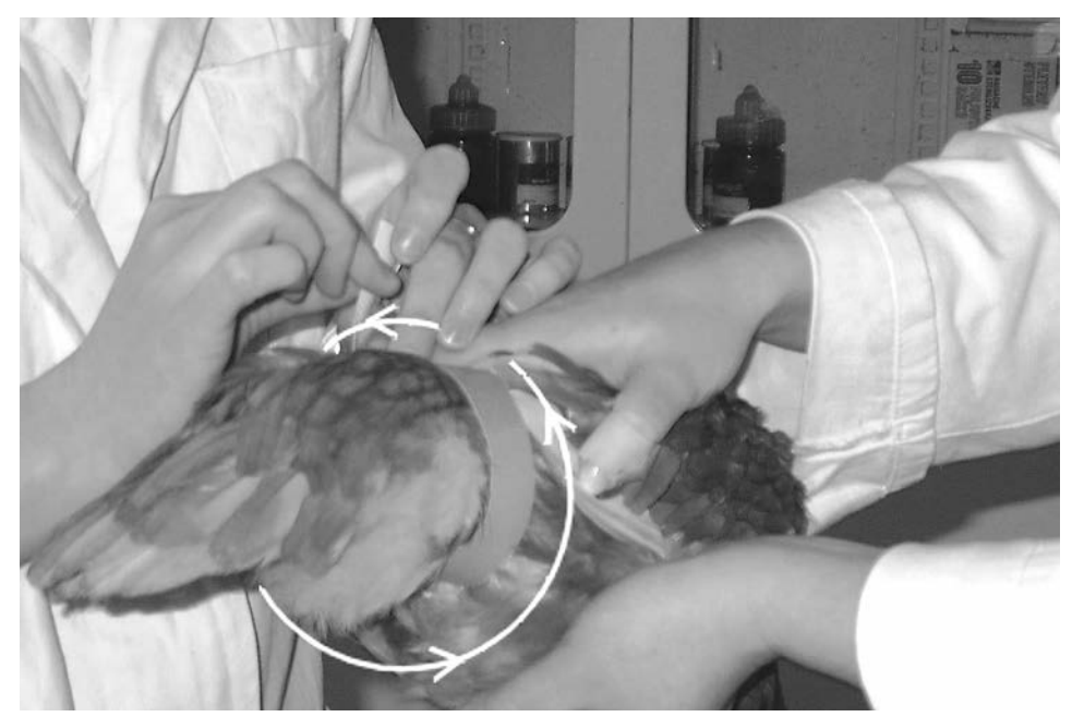
Figure 1. The attachment of the double-side adhesive tape to the caudal part of chicken body around the cloaca