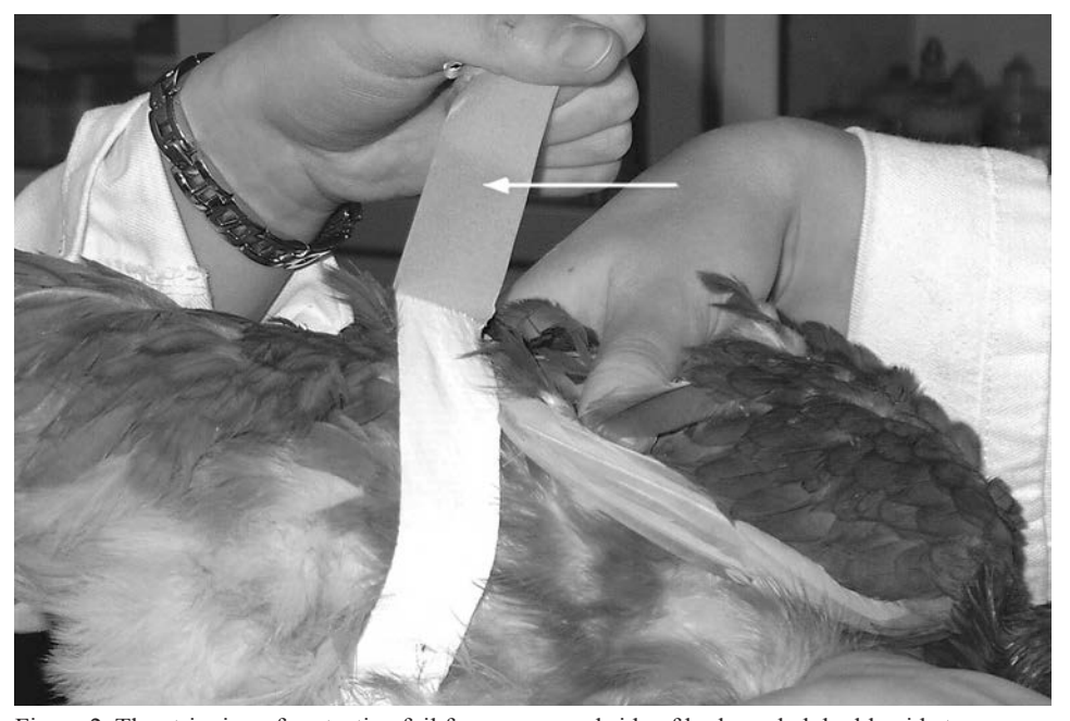
Figure 2. The stripping of protective foil from a covered side of body sealed double-side tape